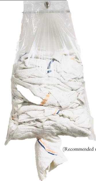
(Recommended use of new packaging)

For more information visit: https://laundryledger.com/new-york-city-council-passes-the-clean-act/